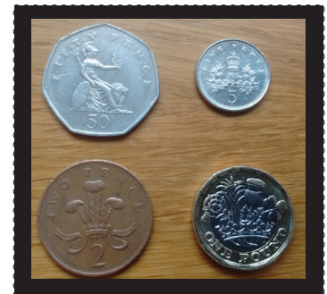
Do you have change?

Day for Change is an appeal by UNICEF to collect change* for our work to keep children safe. This special day happens annually and this year the theme is children in emergencies.